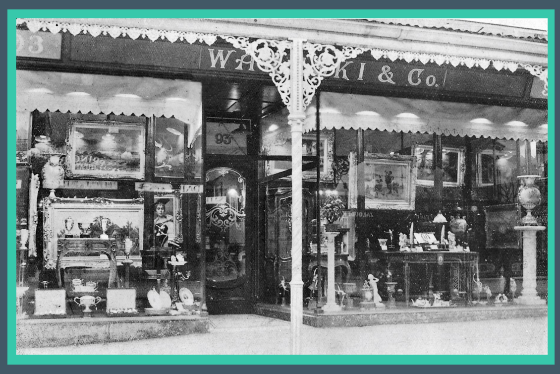
Wartski & Co., 93 Mostyn Street, Llandudno.

Mid-, west, and especially north Wales has a rich Jewish history. Jews moved there in large numbers in the late 19<sup>th</sup> and early 20<sup>th</sup> centuries, escaping persecution in Eastern Europe.