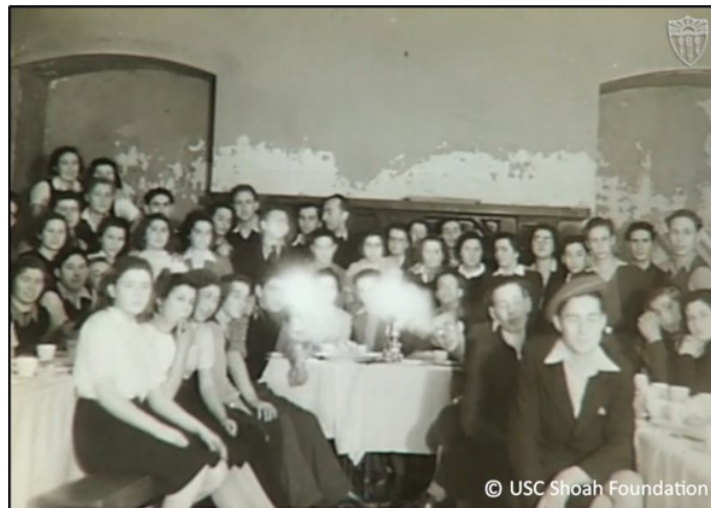
Students in Gwrych Castle.

Image: United States Holocaust Memorial Museum . Original document held at Bibliothèque Historique de la Ville de Paris.