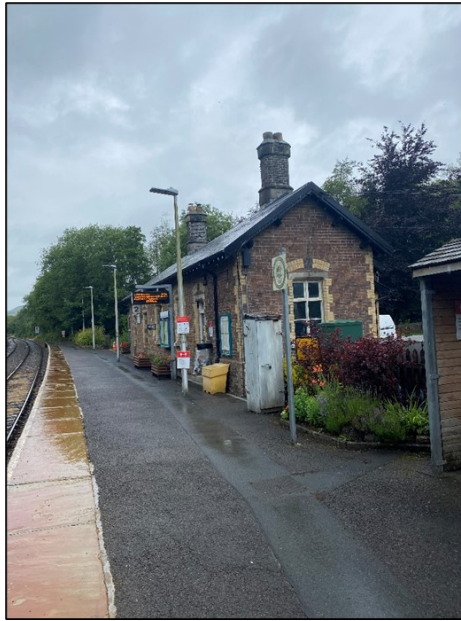
Llanwrtyd Wells Train Station, 2021.