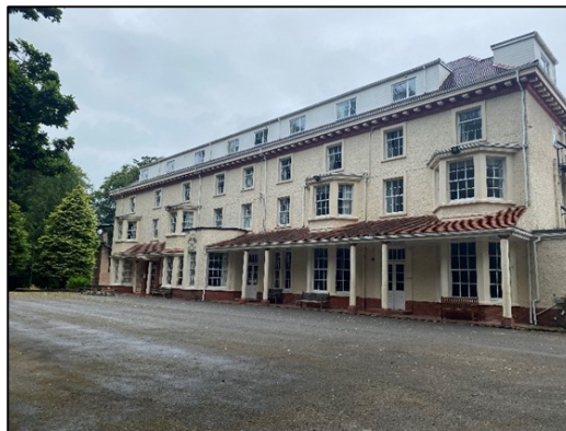
Abernant Lake Hotel in Llanwrtyd Wells.