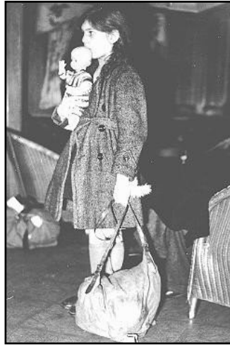
A refugee, part of a children's transport (Kindertransport), shortly after arriving in Harwich, Great Britain, 2 December 1938.

Original document held at Bibliothèque Historique de la Ville de Paris.